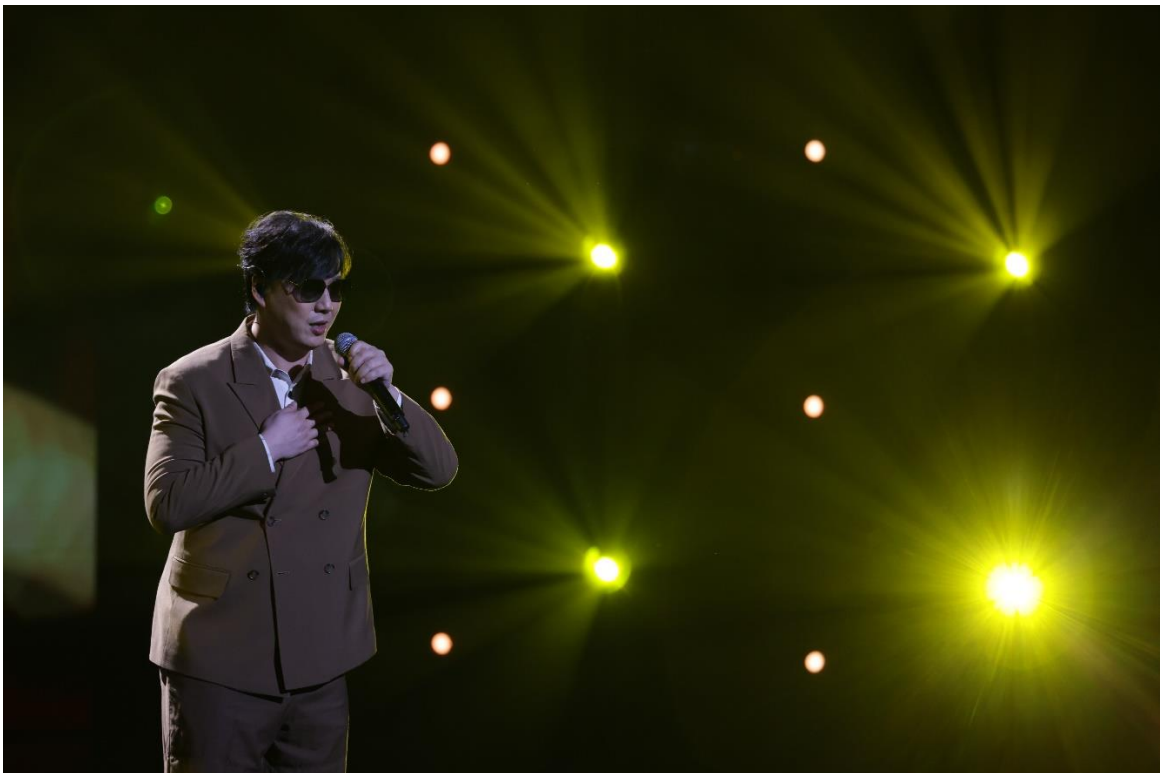
Caption: Song performance by singer-songwriter Ricky Hsiao at the Community Chest: Uniting Hearts 2023 Charity TV Show