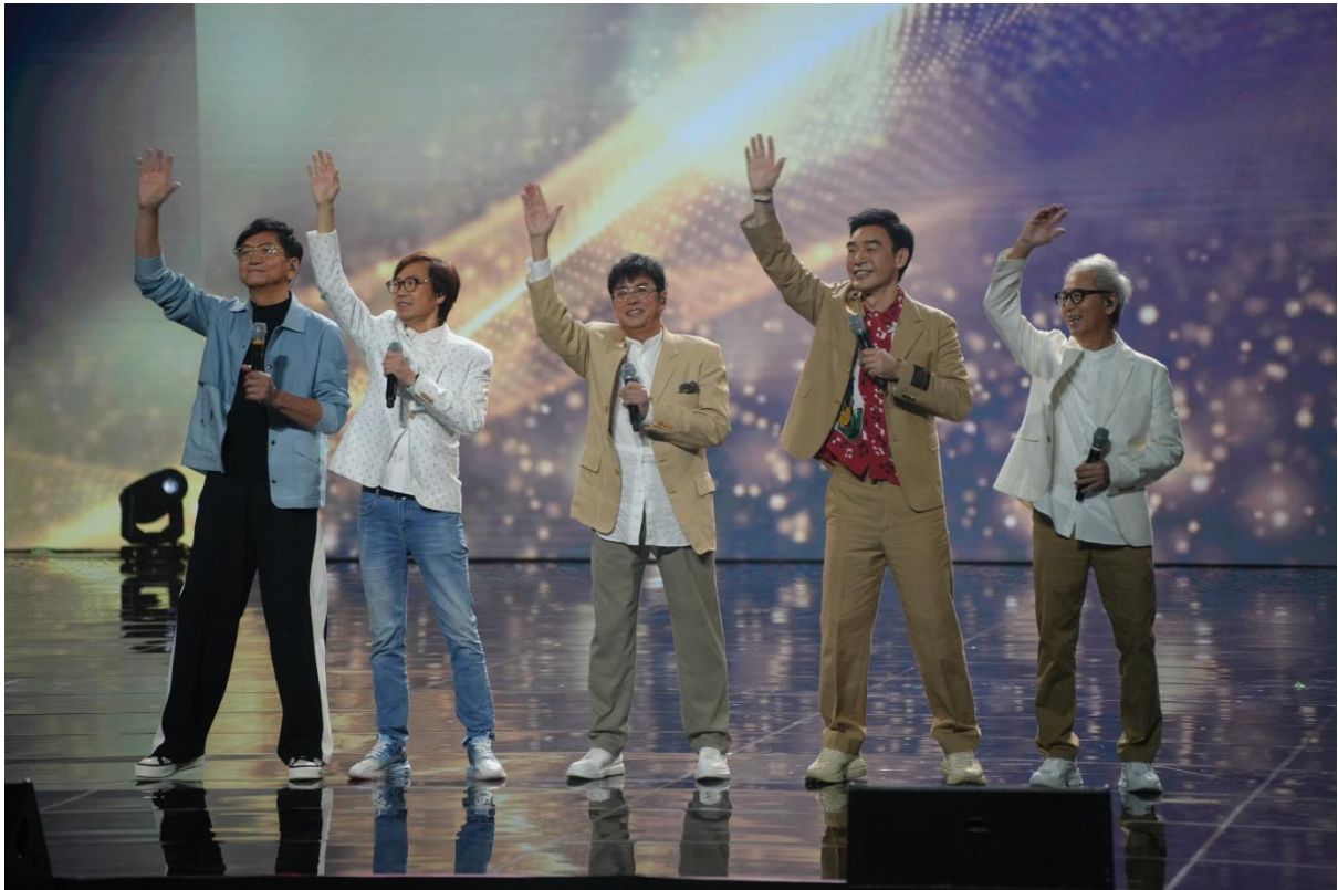
Caption: Song performance by The Wynners at the Community Chest: Uniting Hearts 2023 Charity TV Show