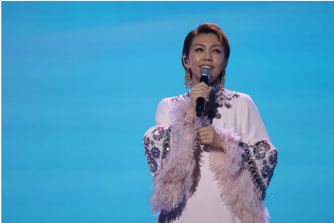
Caption: Song performance by local music icon Kit Chan at the Community Chest: Uniting Hearts 2023 Charity TV Show